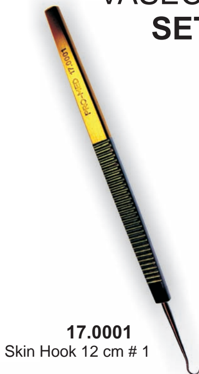
17.0001 Skin Hook 12 cm # 1