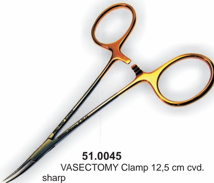
51.0045 VASECTOMY Clamp 12,5 cm cvd. sharp